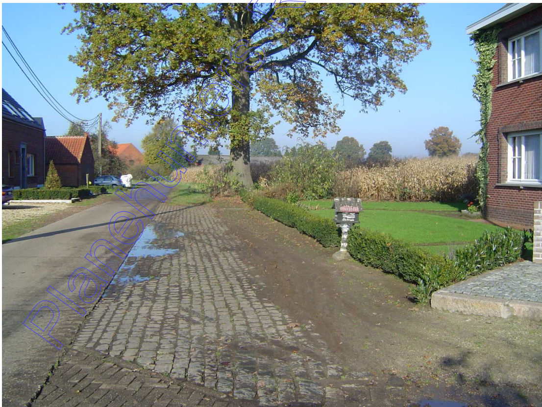
2009 same spot